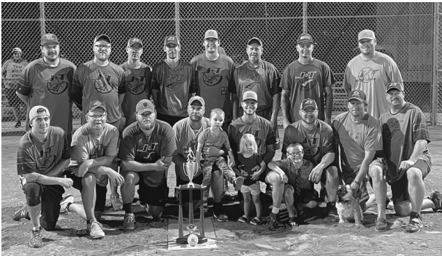
2021 Men's League Champions— J&T Auto

*Interested in umpiring any Adult Softball Leagues? Contact our department. $25/game and paid training*